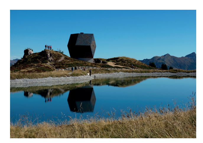
GRANATKAPELLE Mountain Chapel

Surrounded by the beautiful Zillertal Alps, the Granatkapelle Chapel is located at the sunny Penkenjoch plateau. The chapel's architecture incorporates local timber, and the natural beauty of garnets, which have been mined in the nearby Stillup valley for centuries. It is dedicated to Engelbert Kolland, a beatified local.