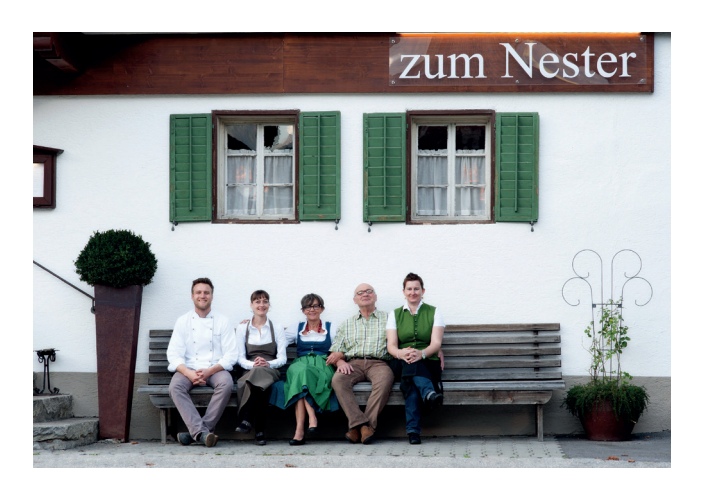
NESTER Hotel & Restaurant

Surrounded by the beautiful Zillertal Alps, the Granatkapelle Chapel is located at the sunny Penkenjoch plateau. The chapel's architecture incorporates local timber, and the natural beauty of garnets, which have been mined in the nearby Stillup valley for centuries. It is dedicated to Engelbert Kolland, a beatified local.