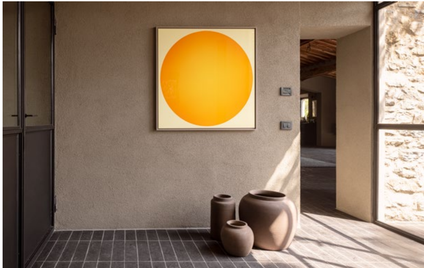
The gray and black color scheme was the product of careful experimentation and deliberately contrasts with the typical terra-cotta tones of Tuscan farmhouses.