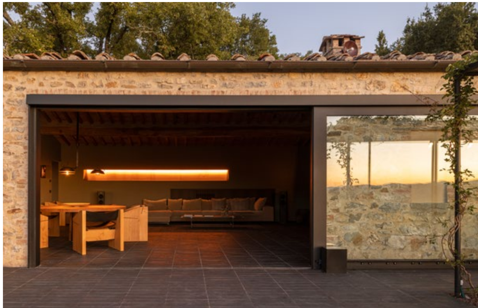
The panoramic window slides back to open the living and dining room to the terrace, with expansive views over the rolling Chianti countryside.