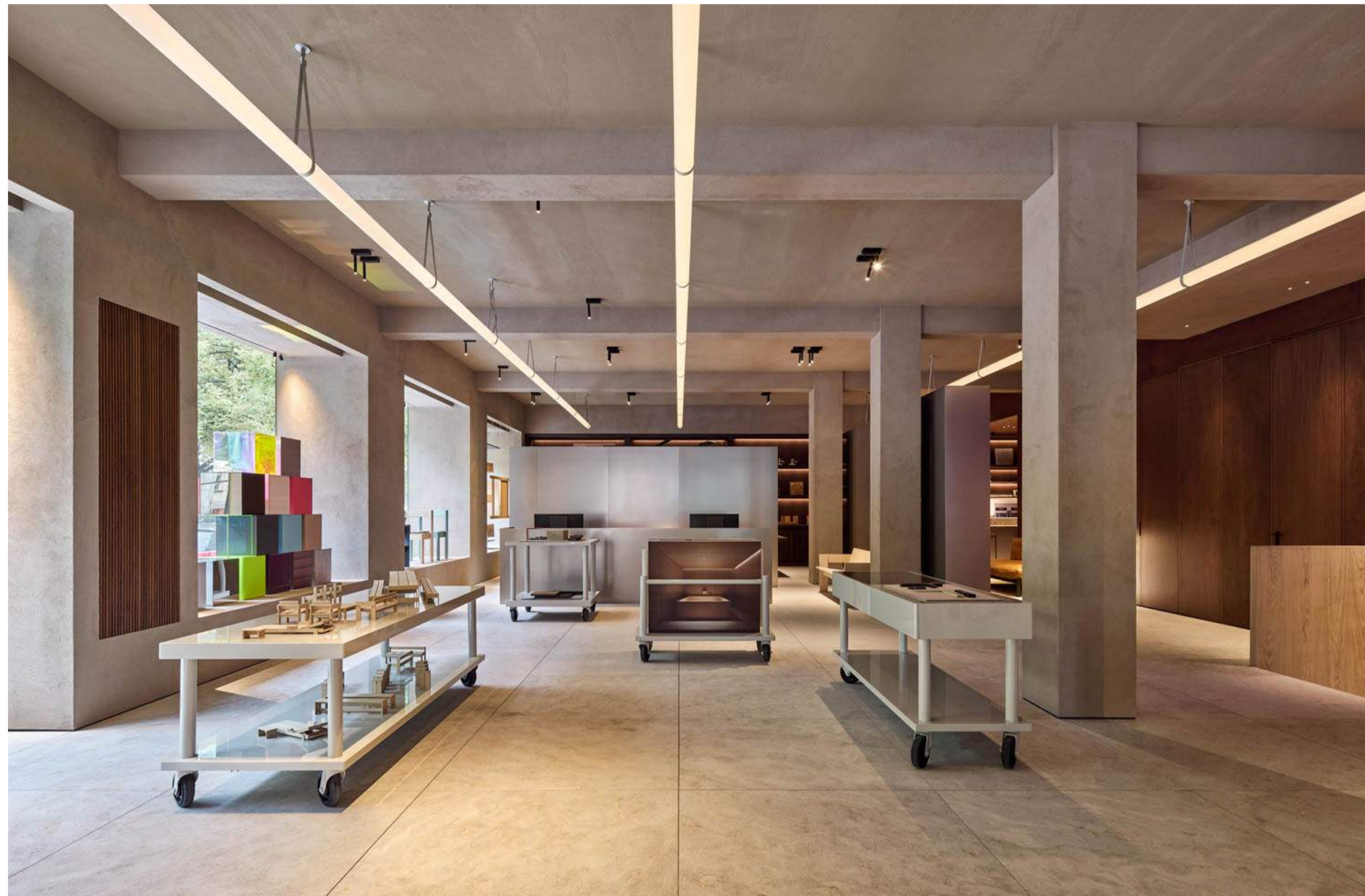
The public-facing main area of the interior design studio displays objects from Holzrausch Editions, a series of collaborations with artists, designers, architects and craftsmen for their interior design projects.