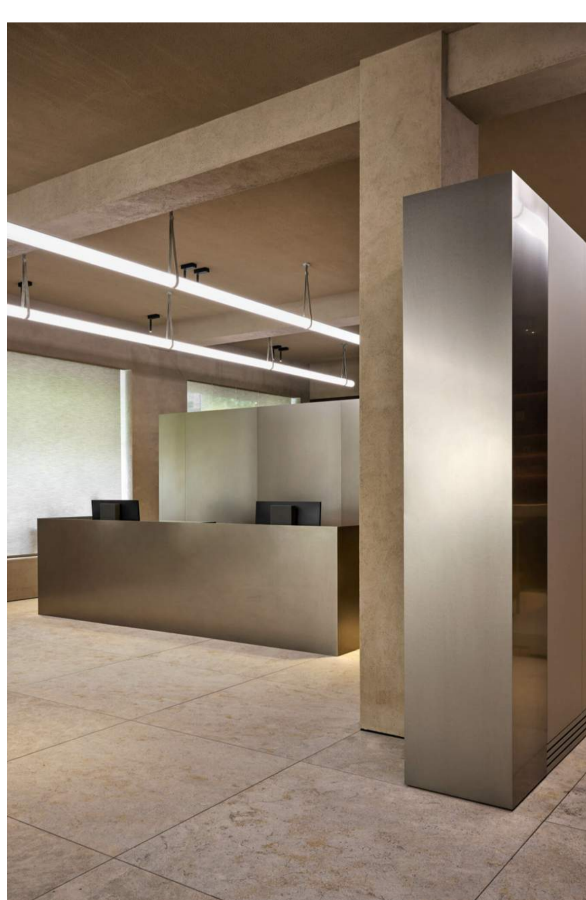
A stainless-steel desk with linoleum top matches a divider that separates reception from the offices where their kitchen system, J*GAST, is made.