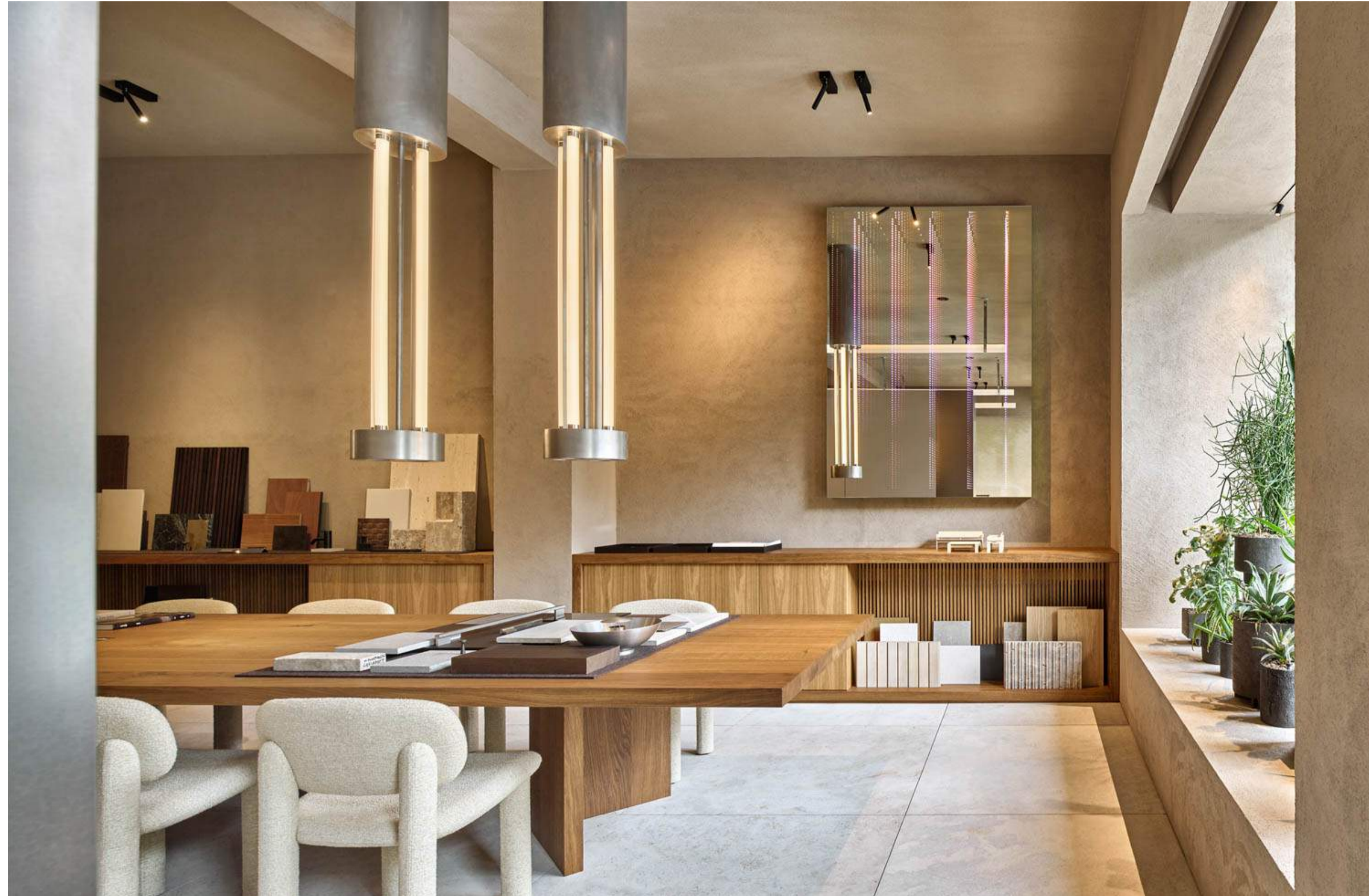
Holzrausch collaborated with DHA on "Nuclear Love," light sculptures that provide both atmospheric and targeted illumination, and a massive oak table, both of which adorn a conference room.

The atmosphere the team aimed for was natural, warm, and calm. To that end, they used abundant natural cement and stone, with pops of contrasting wood and stainless steel. To keep noise down in the open space, they used acoustic ceiling paneling. With just enough detail, it's uncluttered, yet each room offers chances for discovery.