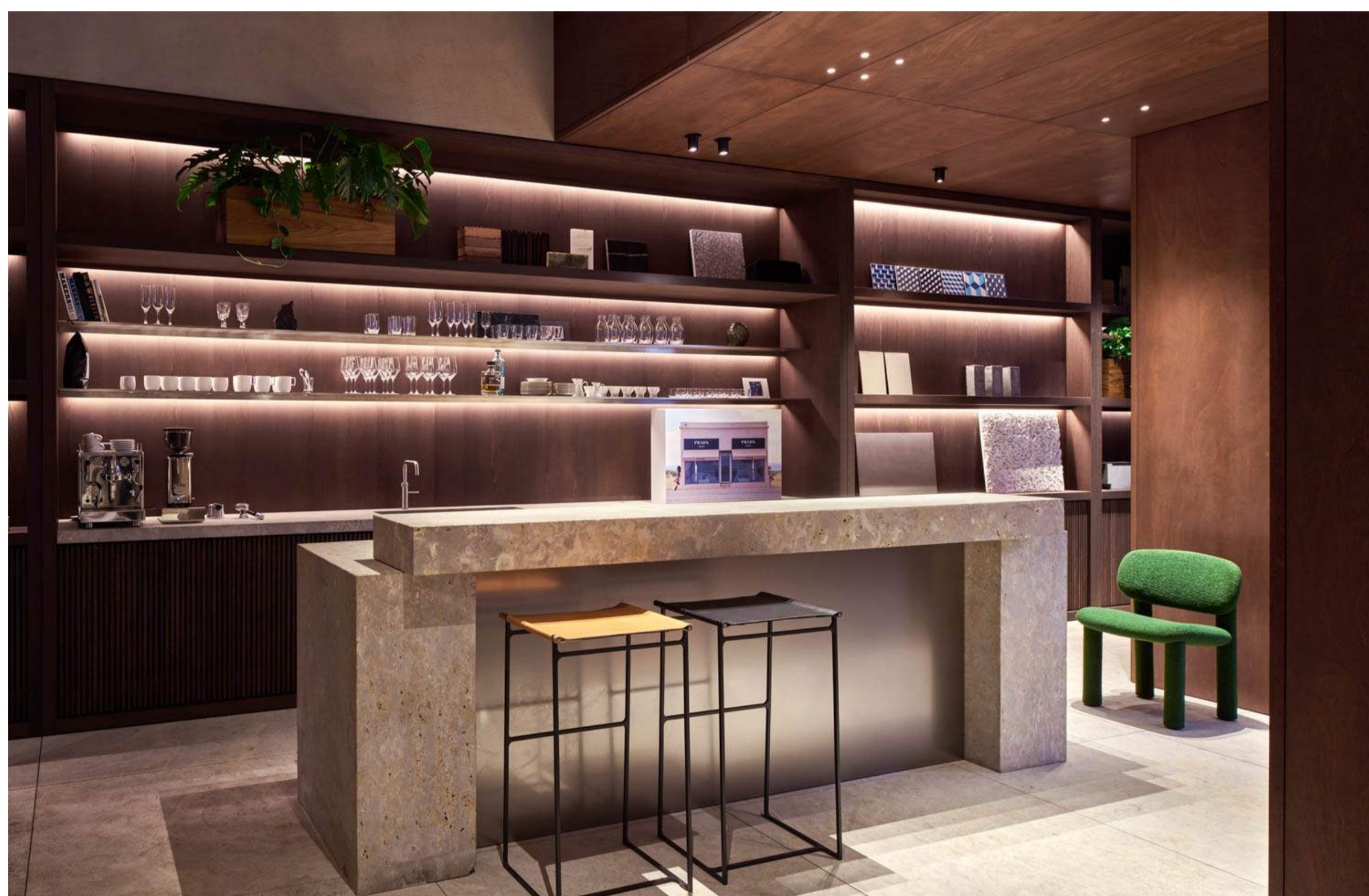
Handmade stools of black steel and tanned cowhide by Klaus Lichtenegger for Holzrausch Editions sidle up to a counter of natural stone in the coffee bar.