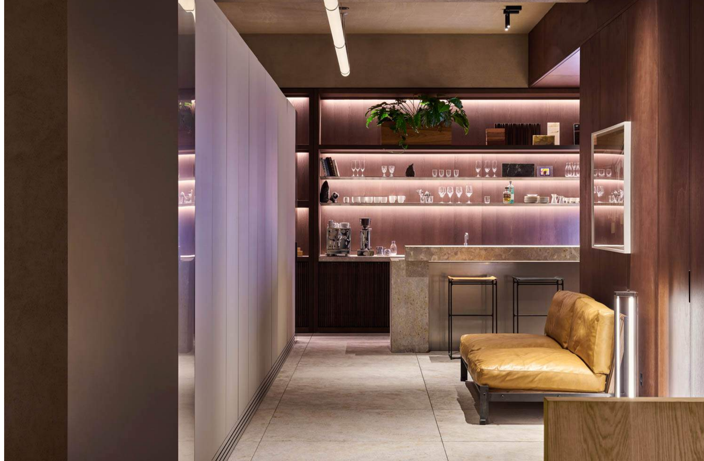
A lounge sofa, also by Klaus Lichtenegger for Holzrausch Editions, contrasts materially with the flooring of scratch-finish shell limestone slabs.