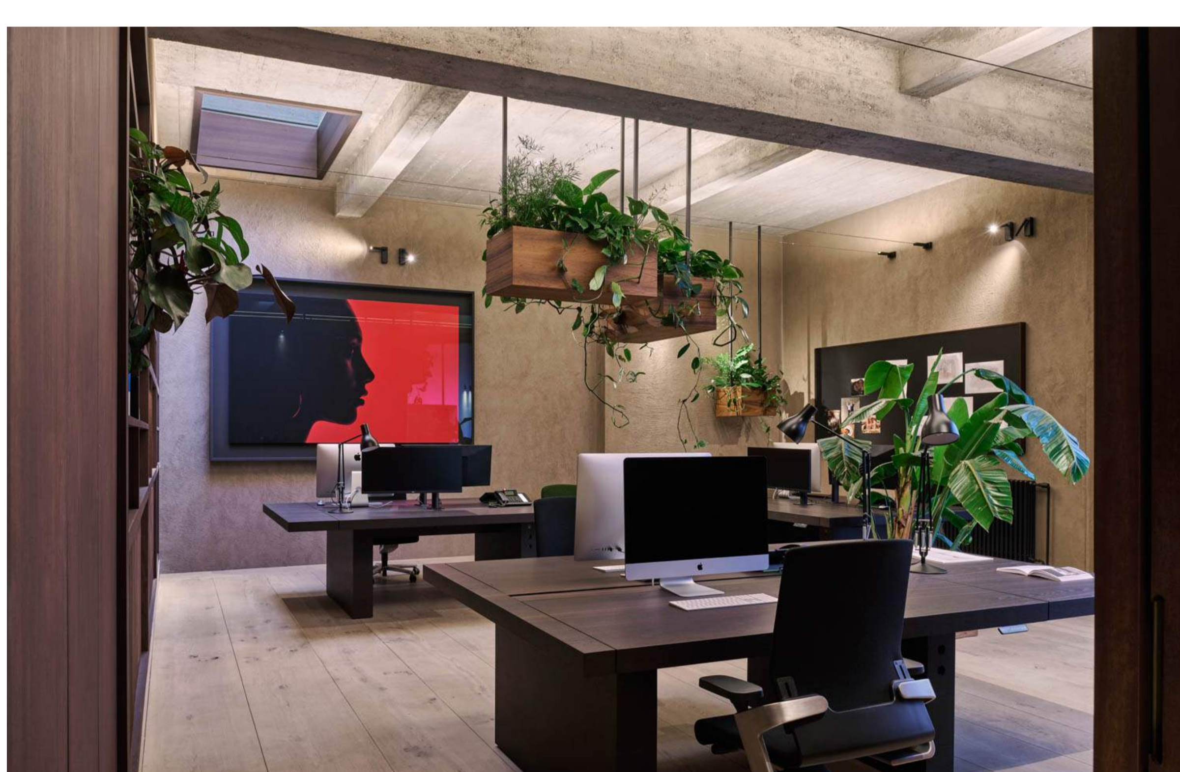
Philodendrons growing in custom teak planters hang from the original concrete ceiling in the interior design studio, where another Holzrausch Edition is on display: a custom-framed photo by fashion photographer Dylan Don.